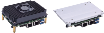
▲ Assembly view