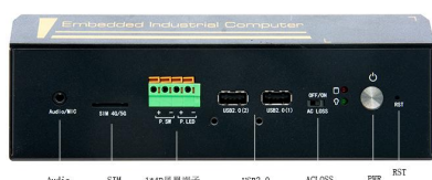
Front IO View