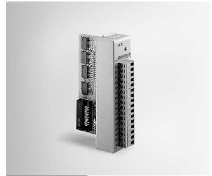
ADAM-5051 ADAM-5051D ADAM-5051S