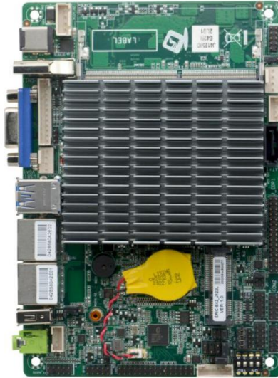
EPIC-E42_J122L VER:1.0 Front View