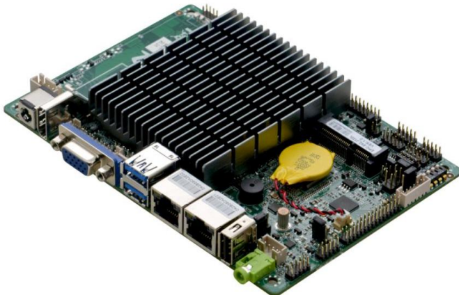
EPIC-E42_J122L VER:1.0 Lateral View