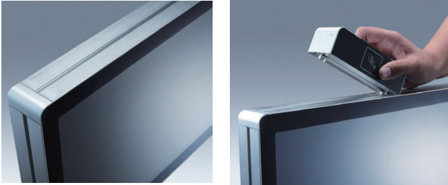
Side groove design for Flexible peripheral device