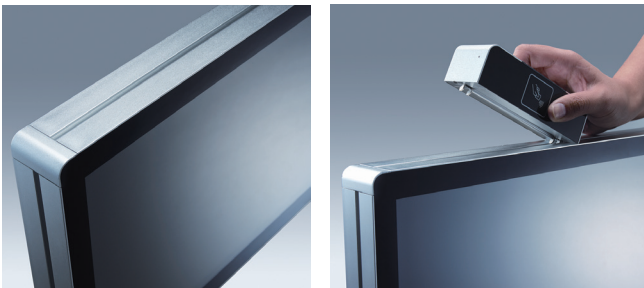
Side groove design for Flexible peripheral device