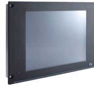
▲ Touch without keypad version