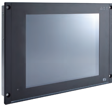
▲ Side view