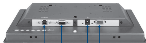
Touch Screen (USB) Touch Screen (RS-232) DC Jack 12V dc VGA Port (100~240V ac adapter included)