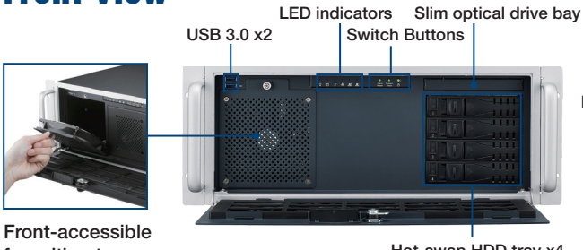
fan without opening top cover