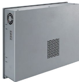
▲ Back view