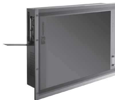
▲ HDD easy maintenance