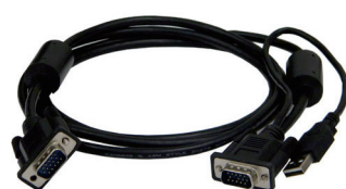
USB KVM Cable