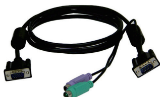
PS2 KVM Cable

Keyboard layout: CH, FR, GR, IT, JP, KR, PT, RU, SP, UK, US